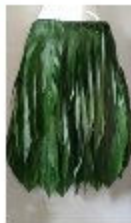
J & I. Trading Tile of Skirt Stripped #8130001 $55

BOYS - FOR KAHIKO YOU WILL NEED LEATHER FERN HEI/HAKU WRISTLETS BLACK KUKUI NIT LEI BLACK PANTS LONG SLEEVE WHITE SHIRT