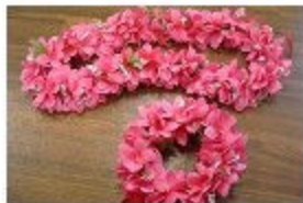
Aloha Hula Supply Nani Lei #L27 $10 Hei #L27H $7

Pink pa'u skirt Pink cami Tile of Skirt Leather fern lei set (lei, hei/crown, anklets, wristlets) Fushia leggings (leggingsonly.com Capri length $12)